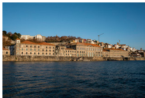
The Alfândega conference center

The 31 st ICAR will take place at the Alfândega conference center, located right at shores of the Douro river, in downtown Porto. The Alfândega (Customs House) played a prominent role in northern Portugal's commerce since the 13 th century. Having moved around the city through the centuries, it eventually settled at its current location, directly linked to the railway system, in the mid-1800s. Having lost importance to both the airport and the shipping port of Leixões, it was recently transformed by the