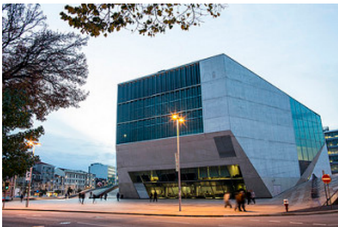
Casa da Música

If you arrive to Porto in advance to the ICAR, you will have the opportunity to attend the "Nos Primavera Sound", an eclectic music festival in the city park (June 7-9), or a concert by the Matosinhos Jazz Orchestra in the Casa da Música (June 9).