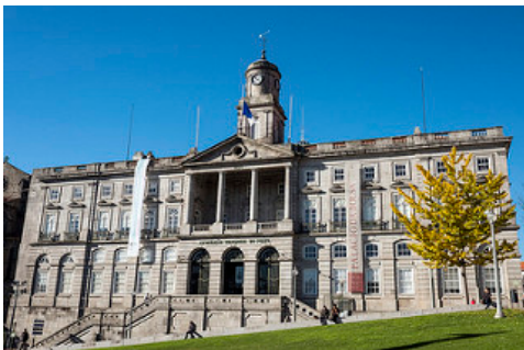
Palacio Da Bolsa

Although tourists have started to come in big numbers, the genuine “Portuense” character is found around every corner. Many of the houses in Ribeira are still inhabited by the locals, who hang their clothes to dry outside their windows as they always did. The local hang out at the local cafés, enjoying their expresso and pastel de nata (custard tart). The people of Porto like to talk loudly and party on the streets. Portuenses are very honest and direct; they welcome tourists but don’t change their habits to accommodate them.