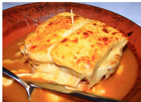
A typical Francesinha

Today, however, the most typical Porto dish is the “Francesinha”, a decadent sandwich inspired by the French croque monsieur, containing many layers of meat and a spicy sauce. After trying one at Café Santiago or Capa Negra II, you might find the energy to climb the 222 steps of the Clérigos tower, an important landmark and an excellent example of the romantic architecture by Nicolau Nasoni (more of Nasoni’s work is scattered through the city).