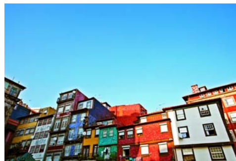
The downtown district of Ribeira

The VIII Ibero-American Summit (1998) was its inaugural act, marking the beginning of a new era for the Alfândega. The museum will be open to ICAR participants through the meeting. The temporary exhibits can be visited, but a ticket must be purchased.